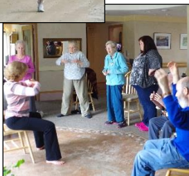
A Qi Gong session

It is a common occurrence that as people get older medical problems limit their ability to exercise. Nevertheless, some activity is better than none. At Pyareo Home twice weekly Qi Gong classes and twice weekly chair yoga classes are offered and very popular. Other residents have enjoyed regular walking in the beautiful surrounding countryside, and a few even bicycling, sometimes with adult tricycles for better balance. These are examples of Pyareo Home working to support its residents in a holistic approach – body, mind and spirit.