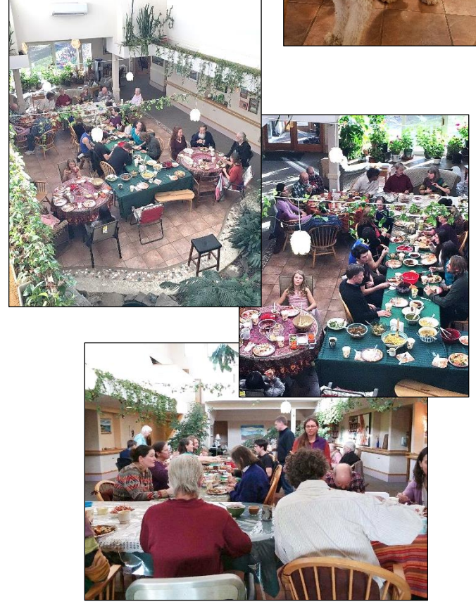
Our community Thanksgiving celebration was a last minute affair. A pot-luck meal was organized on a moment's notice, and there were 27 guests. There was plenty of delicious food made with loving hearts and hands.